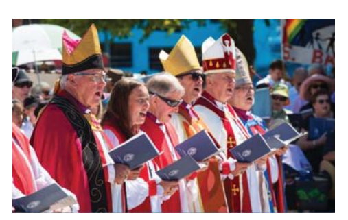
A lineup of Bishops at the Installation Service of Bishop Peter Carrell in Cathedral Square.